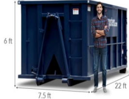
30 cubic yards