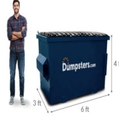
4 cubic yards