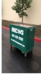
1 cubic yard