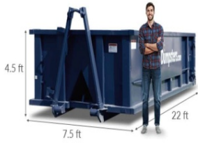
20 cubic yards (Most Common)