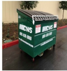
3 cubic yards