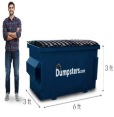
2 cubic yards