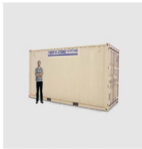
20L-8W-8.5H (Largest realistic portable storage unit)