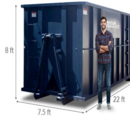
40 cubic yards