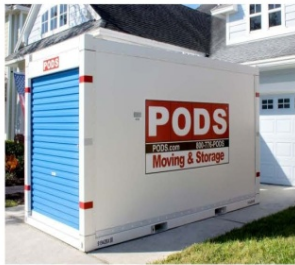
16L-8W-8H (largest POD)